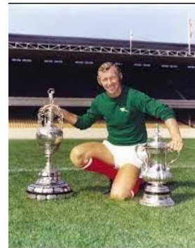
'71 Double Legend